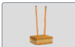
Pencil Holder 30 minutes