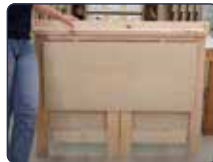
CITF Folding Portable Workbench 10 hours