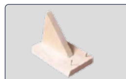
Simple Cell Phone Stand 45 minutes