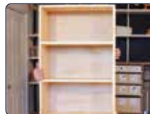
CITF Bookcase 6 hours