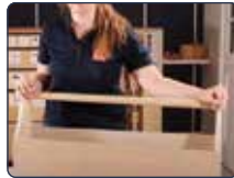
CITF Tool Box 3.5 hours