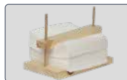
Napkin Holder 180 minutes