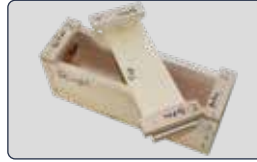
Sliding Top Box 240 minutes