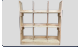
Bookcase with Dowels 360 minutes