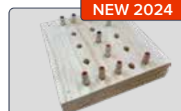
Tic Tac Toe 90 minutes