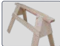
CITF Notch and Bevel Top Sawhorse 6 hours