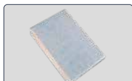
Sanding Block 10 minutes

These projects are good introductions to woodworking for all ages and teach valuable tool skills while offering the reward of a finished project. You can access step-by-step videos and PDFs for the following projects: