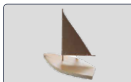
Sailboat 120 minutes