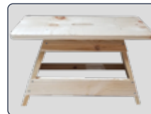
CITF Step Stool* 3.5 hours