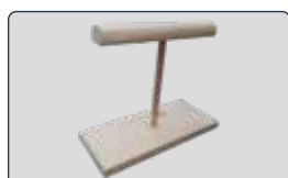
Mask Rack (uses brace drill) 45 minutes