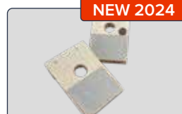
Coin Hole 45 minutes