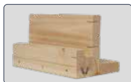
Cellphone and Tablet holder 150 minutes