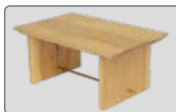
Footstool 180 minutes