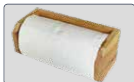
Towel Rack 100 minutes

Intermediate projects build on skills developed from creating basic projects and are appropriate for 4th grade and above: