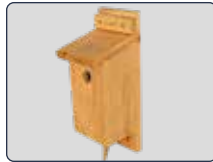
CITF Birdhouse 3.5 hours