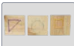
String Art 30 minutes