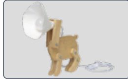
Dog Lamp 240 minutes