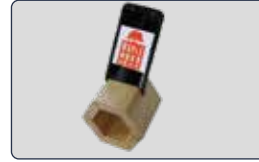
Hexagon Speaker 240 minutes