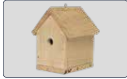
Wren Bird House 240 minutes

Advanced projects require more time, tools and skill. These are appropriate for experienced woodworkers in middle and high school: