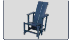
Wave Hill Chair 600 minutes