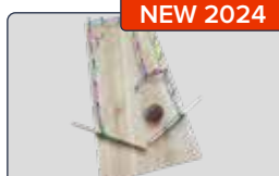
Mini Pinball 30 minutes