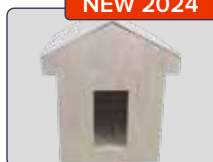
Dog House 30 hours