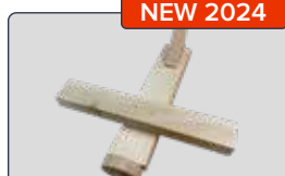
Airplane 90 minutes