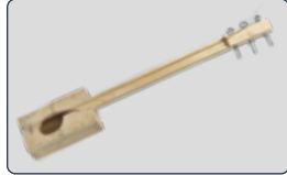
Three String Guitar 360 minutes