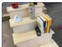
Stair Step Bookcase 3 hours