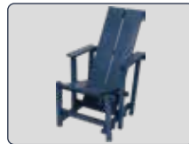
Advanced Wave Hill Chair 10 hours