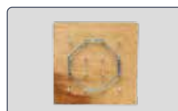
Geoboard 90 minutes