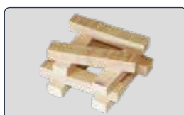
Tower Blox 90 minutes