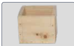
Keepsake Box 120 minutes