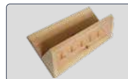
Trophy Rack 150 minutes