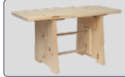
Buddy Bench 480 minutes