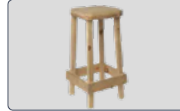
Kitchen Stool 540 minutes