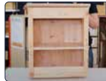
Advanced Little Free Library 6 hours