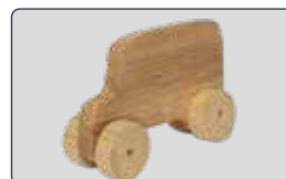
Cutout Car 150 minutes