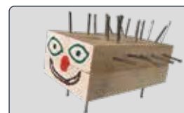
Porcupine 45 minutes