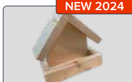
Bird Feeder 60 minutes