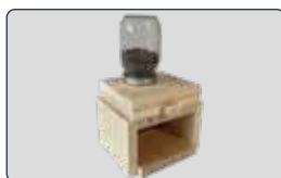
Candy Dispenser 150 minutes