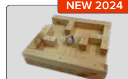
Marble Maze 90 minutes